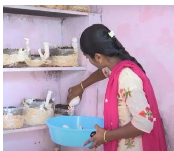
Fig. 11. Learning how to cultivate mushrooms

mushrooms can have a transformative effect on their dietary habits. Mushrooms, which are nutrient-dense and relatively easy to grow, can be a sustainable and affordable source of essential nutrients such as vitamin D, iron, and protein (Feeney et al., 2014). By learning how to cultivate mushrooms themselves, rural women can both improve their nutritional intake and gain an economically viable skill that contributes to household food security. Through education, women are better equipped to diversify their diets and incorporate more healthful foods, leading to long-term improvements in health outcomes.