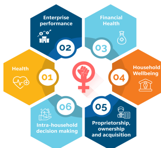
Fig. 17. Impact on health and economic empowerment