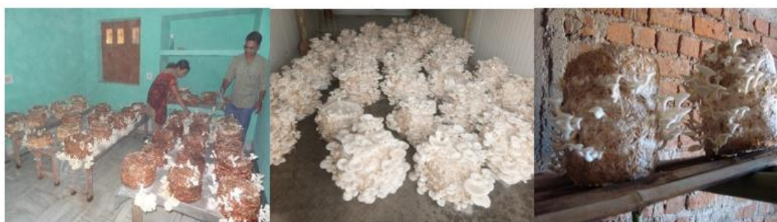
Fig. 15. Enhancing food security through local production

Mushroom cultivation also offers economic empowerment by enhancing women's financial literacy and entrepreneurship skills. Participating in mushroom production requires women to engage in basic business activities such as budgeting, marketing, and sales, helping them develop essential financial skills. These skills are transferable to other areas of their lives and can increase their overall economic independence. Moreover, women involved in mushroom farming often become more integrated into local economies, establishing networks with buyers, suppliers, and other farmers, which strengthens their social capital and improves their access to financial services (FAO, 2019). The economic benefits of mushroom production extend beyond individual households to the broader community. As more women engage in mushroom cultivation, they contribute to local economic development by creating jobs, generating income, and stimulating local markets. In many cases, mushroom production can become a community-led initiative, where women's cooperatives manage larger-scale farms that supply both local and regional markets. These cooperatives not only improve the financial well-being of their members but also create a sense of solidarity and shared purpose, which can lead