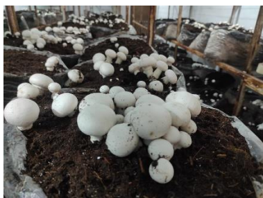
Fig. 12. Mushroom cultivation