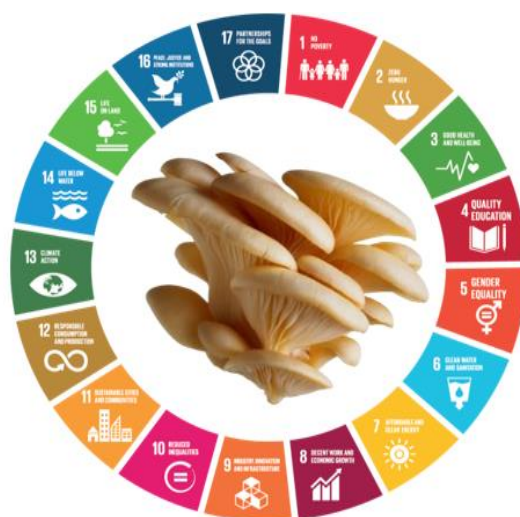
Fig. 19. Sustainability and Long-Term Benefits of mushrooms