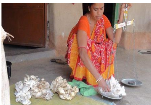
Fig. 18. Village Square

The economic empowerment of rural women through mushroom production also contributes to reducing gender disparities in agriculture. Traditionally, men have dominated agricultural activities in many rural areas, with women playing supportive roles. However, mushroom cultivation provides an opportunity for women to take ownership of an agricultural activity that is relatively low-cost, low-labor, and highly profitable. By gaining control over this segment of agriculture, women can challenge traditional gender roles and become more active participants in the rural economy. In many cases, women's cooperatives have formed around mushroom production, further enhancing their bargaining power and access to markets (FAO, 2019). Reducing gender disparities and promoting economic independence through mushroom production also have broader implications for rural development. When women are economically empowered, they are more likely to invest in their children's education and healthcare, leading to long-term improvements in the well-being of future generations. Furthermore, financially independent women are better positioned to participate in community decision-making processes, advocating for policies and initiatives that benefit their families and communities.