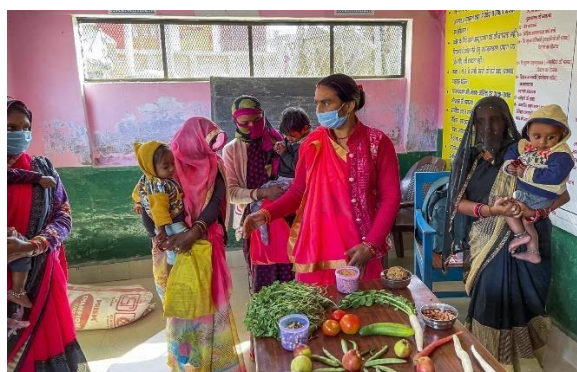
Fig. 1. Awareness camp for rural women