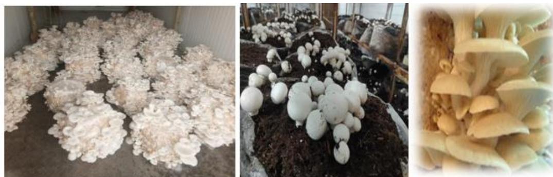
Fig. 13. Sustainable mushroom cultivation

By participating in mushroom production, rural women can sell their surplus produce at local markets, generating income that can be reinvested into their households or communities. The sale of mushrooms, particularly in urban markets where demand for fresh, organic produce is growing, can provide women with a consistent revenue stream. Additionally, value-added products such as dried mushrooms, mushroom powder, or mushroom-based snacks can further increase profitability by catering to a broader market segment (Kimenju et al., 2016). These value-added products have a longer shelf life and can be sold at higher prices, allowing women to maximize their earnings.