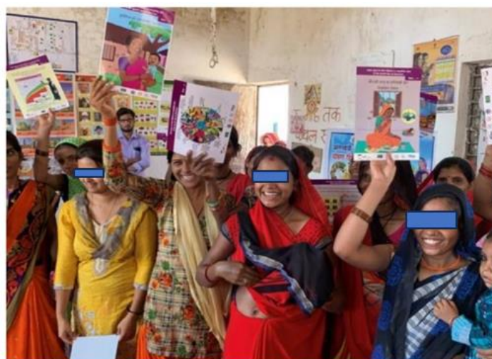
Fig. 9. Importance of Nutrition Education for Rural Women

Image Source: https://gender-works.giz.de/ (Ruel et al., 2018)