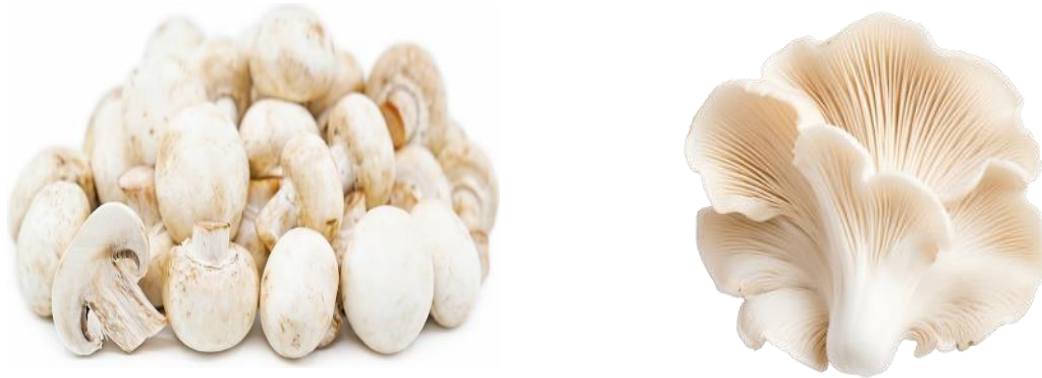
Fig. 5. Different species of mushrooms

Minerals such as selenium, copper, and potassium are also present in significant amounts in mushrooms. Selenium, a powerful antioxidant, protects cells from damage caused by free radicals and supports immune function, reducing the risk of chronic diseases like cancer and heart disease (Largeteau & Savoie, 2010). Potassium helps in maintaining proper fluid balance, muscle contractions, and nerve signals, making it important for cardiovascular health. Copper, on the other hand, aids in the production of red blood cells and supports immune function, which is crucial for rural women, who are often at risk of anemia and other immune-related conditions due to poor dietary intake.