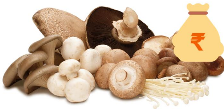
Fig. 14. Economic empowerment through mushroom production