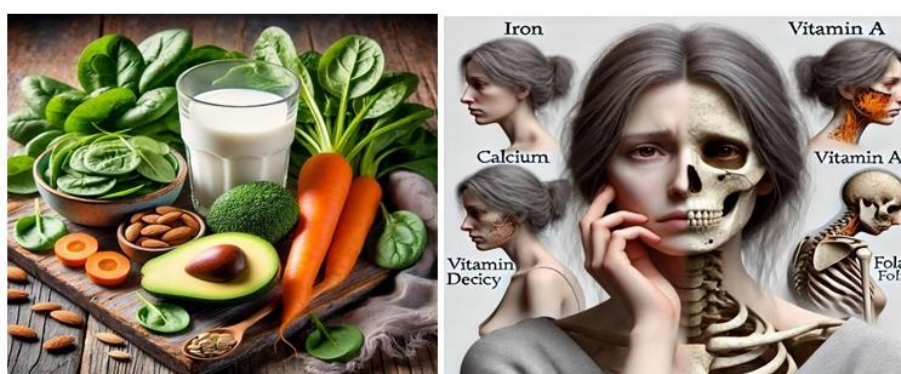
Fig. 2. Sources & Deficiencies of Iron, Calcium, Vitamin A & Folate