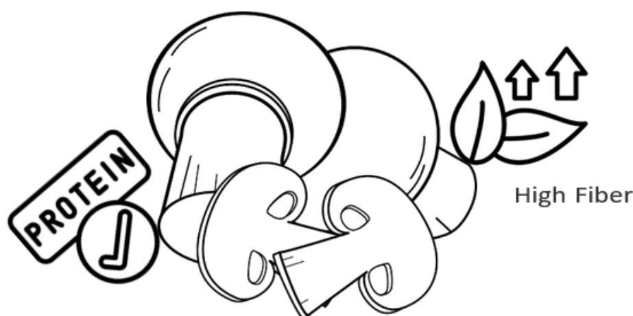
Fig. 7. Protein and fiber content in mushrooms