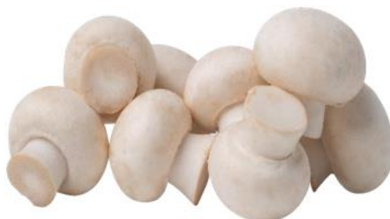
Fig. 4. Mushrooms