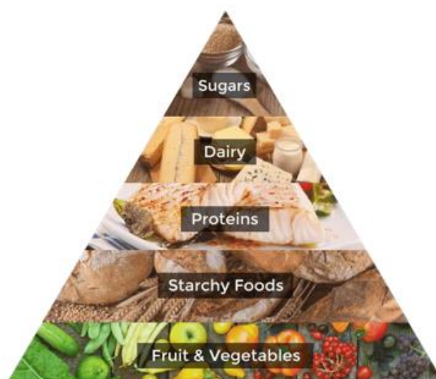
Fig. 10. Shifting Dietary Patterns through Education

Image Source: https://gender-works.giz.de/ (Ruel et al., 2018)