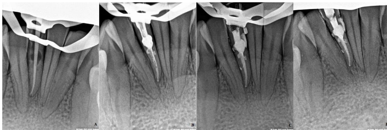
Fig. 3. A) gutta-percha cone fit B) down-pack C) backfill D) final radiograph with a provisional restoration.

(Dentsply). Appreciation of blood-spots on the coronal portion of the paper points confirmed communication with the periodontal ligament. During the one-session treatment, the down pack of a reciprocal gutta-percha R25 (VDW) was achieved with BeeFill 2 in 1 System (VDW), followed by backfill with increments of 2mm of gutta-percha using the same device and a Machtou plugger (VDW-Zipperer) (Figs. 3A, 3B, 3C), and a temporary filling of the access cavity (Cavit. 3M ESPE AG Dental Products) (Fig. 3D).