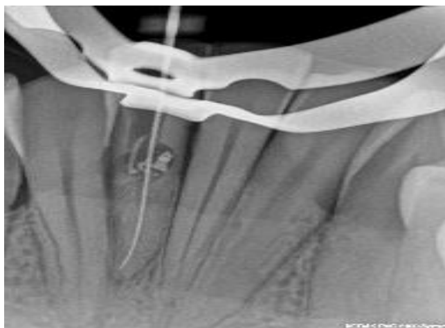
Fig. 2. Conductometry radiograph showing the working length.

previously-treated tooth with apical periodontitis. The primary purpose of treatment was to remove the infection and allow periapical healing. The tooth was isolated with a rubber dam, and access was gained to the pulp chamber. Working length (WL) was established using a size 10 K-file and an electronic apex locator (Root ZX Mini, JJ Morita) to 20mm (Fig. 2).