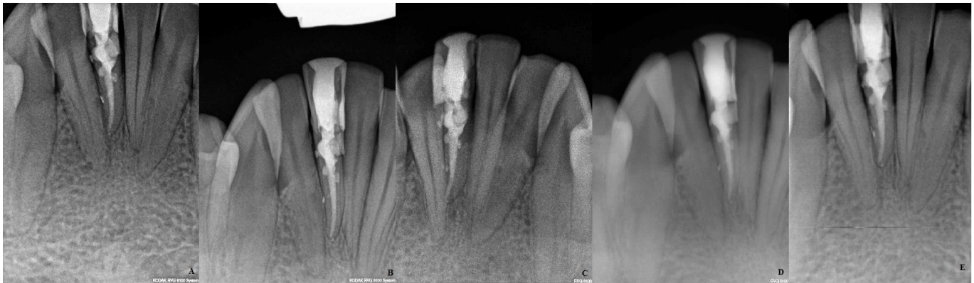
Fig. 5. A) follow up two years B) follow up six years C) follow up seven years D) follow up eight years E) 10 years.